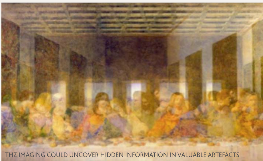
THz IMAGING COULD UNCOVER HIDDEN INFORMATION IN VALUABLE ARTEFACTS