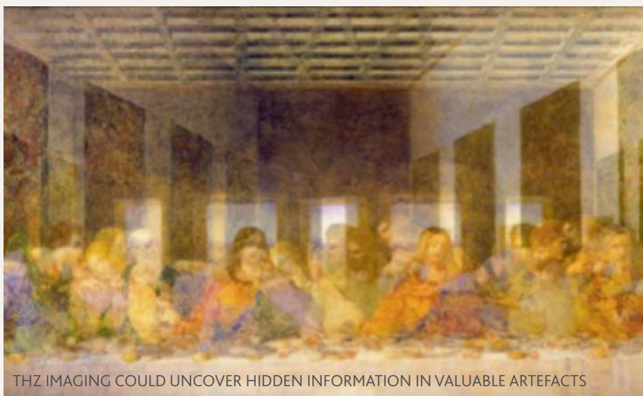
THz IMAGING COULD UNCOVER HIDDEN INFORMATION IN VALUABLE ARTEFACTS