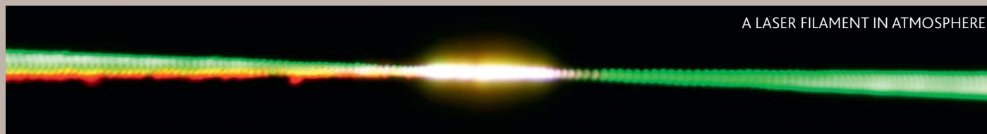
A LASER FILAMENT IN ATMOSPHERE

Harnessing ultrafast lasers in the Terahertz range of the spectrum, the FP-6 funded MULTIRAD study has broad-ranging applications, from metamaterials to masterpieces